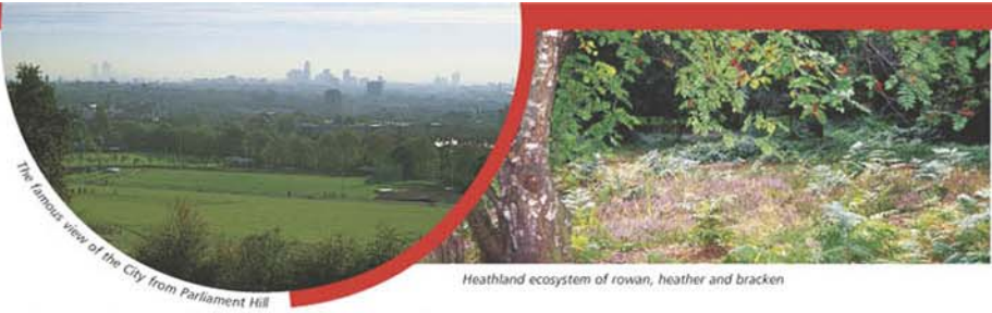
Heathland ecosystem of rowan, heather and bracken

Based upon the Ordnance Survey mapping with permission of the Controller of Her Majesty's Stationery Office. ©Crown copyright. Unauthorised reproduction infringes crown copyright and may lead to prosecution or civil proceedings. Corporation of London 087254 - 2003. This mapping is provided by the Corporation of London under licence from the Ordnance Survey in order to fulfil its function to maintain and promote its open spaces for the recreation and enjoyment of the public. Persons viewing this map should contact Ordnance Survey Copyright for advice where they wish to licence Ordnance Survey mapping for their own use.