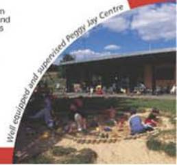
Well equipped and supervised Peggy Jay Centre

Please note that the map does not show all of the many informal paths